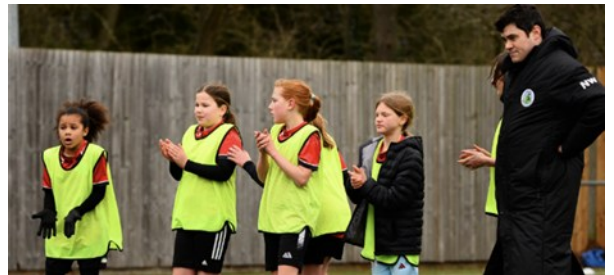
Just look at the shootout tension!